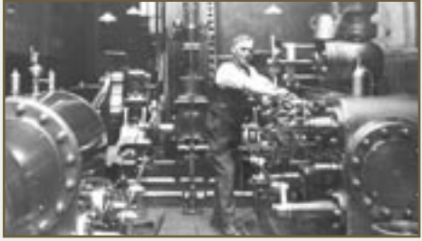
Clough Mill Engine

A very powerful engine. When fuel is burned inside the engine, hot air and gases are produced and then pushed out of the back of the engine at high speed which forces the engine forward.