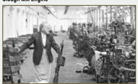
Weaving at Bancroft Mill