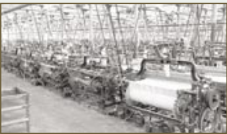
Weaving at Bancroft Mill